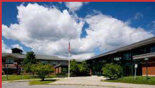
HOPKINTON HIGH SCHOOL